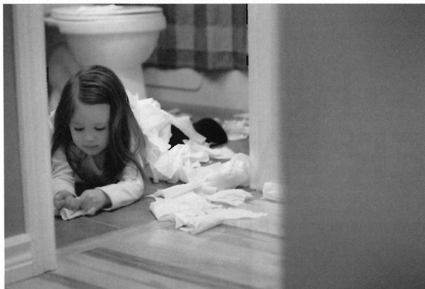
Far from engaging in mindless destruction, children who explore everyday objects by playing with them in unusual (albeit occasionally messy) ways are developing their creativity.

Parents should let children be children—not just because it should be fun to be a child but because denying youth’s unfettered joys keeps kids from developing into inquisitive, creative creatures, Elkind warns. “Play has to be reframed and seen not as an opposite to work but rather as a complement,” he says. “Curiosity, imagination and creativity are like muscles: if you don’t use them, you lose them.” M