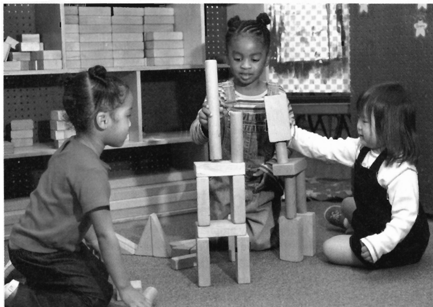
One study found that kids who played with blocks scored higher on language tests than kids who had no blocks. Perhaps the children with blocks simply spent less time on unproductive activities such as watching TV—but the end result was good for them in any case.

Does lack of play, then, impede the development of problem-solving skills?