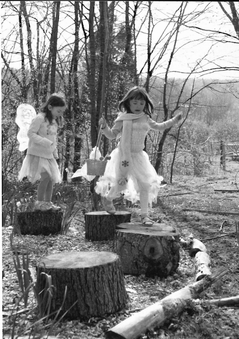
Dressing up and pretending to be someone else is a type of “free play,” as psychologists call it—the unstructured, imaginative fun that is most challenging to the developing brain.

spent 18 years observing animals to learn how to define play: it must be repetitive—an animal that nudges a new object just once is not playing with it—and it must be voluntary and initiated in a relaxed setting. Animals and children do not play when they are undernourished or in stressful situations. Most essential, the activity should not have an obvious function in the context in which it is observed—meaning that it has, essentially, no clear goal.