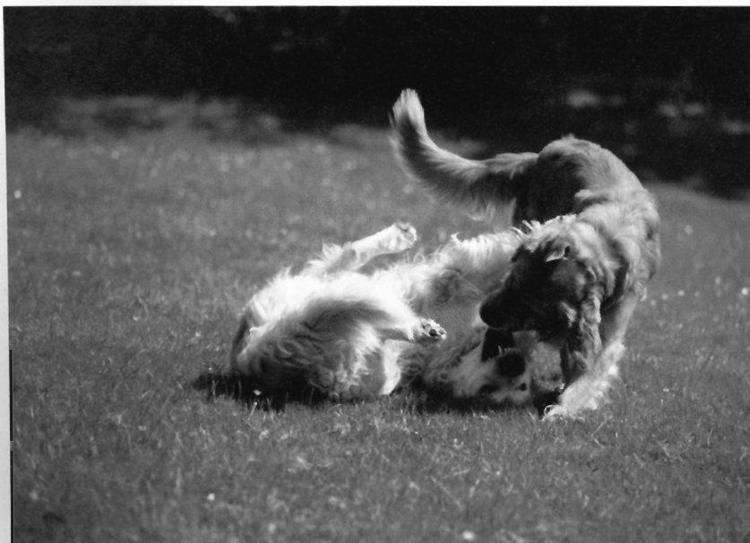
When animals play, their body language signals that any nipping or tumbling is meant to be friendly and fun. Play similarly teaches kids to better communicate with one another.

Most psychologists agree that play affords benefits that last through adulthood, but they do not always agree on the extent to which a lack of play harms kids—particularly because, in the past, few children grew up without ample frolicking time. But today free play may be losing its standing as a staple of youth. According to a paper published in 2005 in the Archives of Pediatrics & Adolescent Medicine , children's free-play time dropped by a quarter between 1981 and 1997. Concerned about getting their kids into the right colleges, parents are sacrificing playtime for more structured activities. As early as preschool, youngsters' after-school