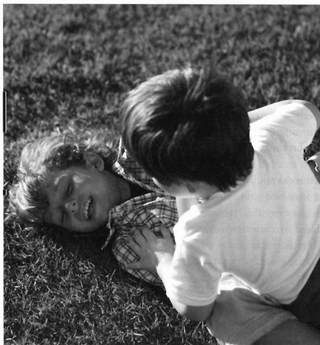
Many children (especially boys) like to engage in mock fighting, or rough-and-tumble play. By constantly alternating who is “winning” the fight, they learn give-and-take and other social skills. Such roughhousing has even been shown to improve creativity and problem-solving abilities.